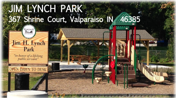
JIM LYNCH PARK 367 Shrine Court, Valparaiso IN 46385