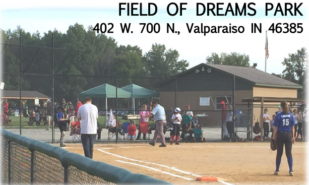
FIELD OF DREAMS PARK 402 W. 700 N., Valparaiso IN 46385